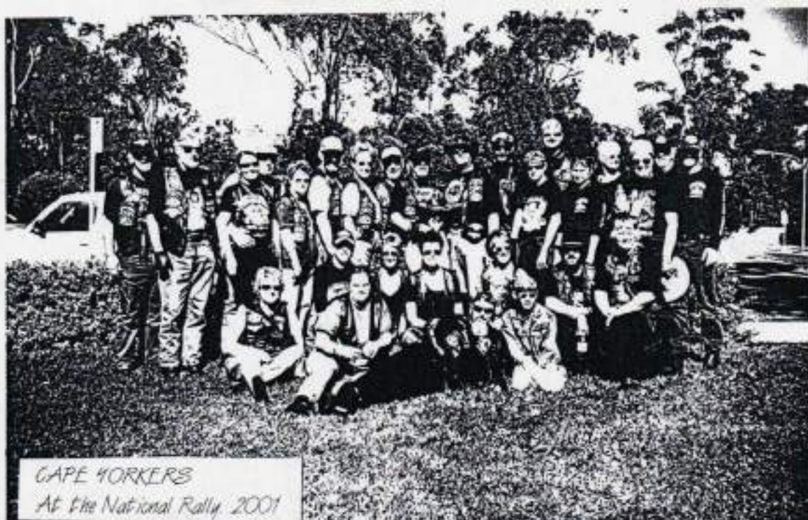
CAPE YORKERS At the National Rally 2001